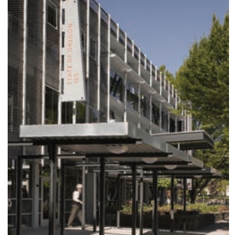
EUGENE STATE OFFICE BLDG. ARCHITECT: PIVOT Architecture

The Co-op is a family-friendly housing community with strong ties to their Whiteaker neighborhood; it is a limited equity cooperative geared as a transitional opportunity for low-income people who are either severely under-housed or without housing.