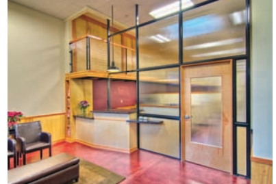
DUVALL LAW BUILDING ARCHITECT: Nir Pearlson

A sun filled house in the woods. The design maximized solar orientation, and includes domestic hot water & floor heating system with sloped Structural Insulated Panel roofs. The S.I.P.s are used as a thermal mass and storm water management system.