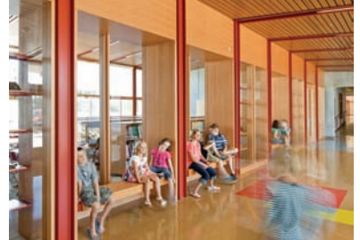
THURSTON ELEM. SCHOOL ARCHITECTS: Mahlum & Robertson Sherwood Architects, PC

The 100-year-old downtown commerce building was nicely transformed into law office suites and common areas. The design maximized daylight as much as possible for the six law offices along the north wall.