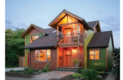
REINHART / GRAY RESIDENCE ARCHITECT: Nir Pearlson

Designed as a prototype, some key goals for the project include providing a welcoming environment that encourages learning; the integration of energy saving features that serve as learning tools; and creating a social center for the community.