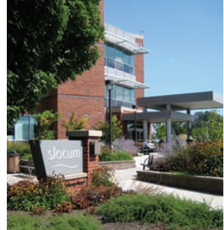
SLOCUM CENTER LANDSCAPE ARCHITECT: Cameron, McCarthy Gilbert Scheibe

Prior to renovation, the building was a nondescript structure in downtown Eugene. The design sought to transform the dated structure into a contemporary office building, providing pleasing work environments utilizing sustainable strategies.